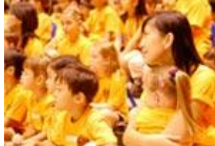
exhibit behaviors conducive to physical wellness, understand the spiritual and emotional dimensions of health, and are appropriate role models of wellness in their communities;